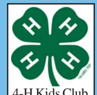
4-H Kids Club Appropriate Use